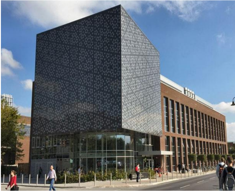
Analogue Devices Building

Bus stop Stables City centre line 308, 307, 304A, 304 (for more details see map below and how to get travel guide on EMRA WEBSITE: http://emra-18.marinerobotics.eu/travel/ .)