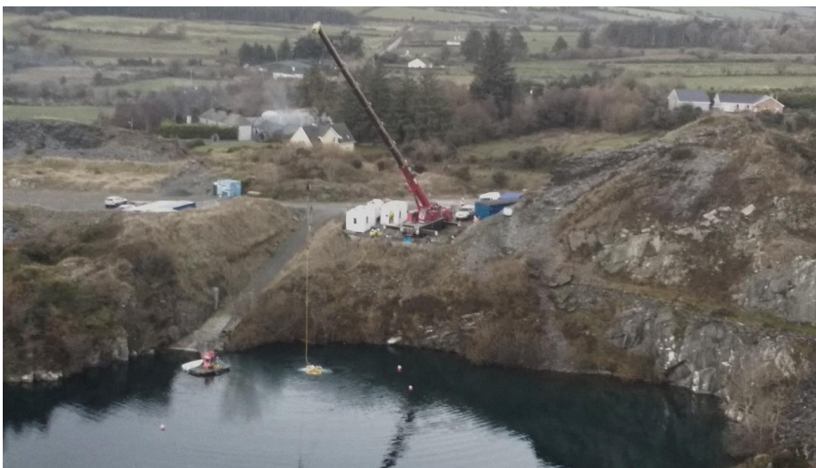
Figure: ROV ops site setup

The trials were carried out in depths of 35m in collaboration with the Marine Institute in November 2016. The invited talk will describe the operations from inception to execution and will detail the various tasks completed over the 3 days of in-water trials.